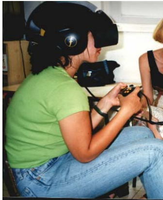
Figure 5: A participant wearing the Head Mounted Display and using the joystick whilst experiencing the virtual world.

The entire “experience” is a journey into four VR worlds—a forest, a playroom in a kindergaretn, a playground, and a vacuum cleaner and a drill moving in another room. Altogether create a VR experience. The participant had to stroll through the rooms without assistance. The length of this VR experience for each participant was 10 minutes approximately in which she has experienced the 4 worlds.