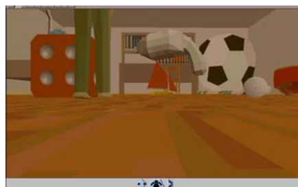
Figure 4: the drill in action in the virtual world's third room.

This experience represents the toddler's inability to fully distinguish between imagination and reality. According to Piaget, the infant tends to attribute Magian importance to his/her thoughts. The infant thinks s/he can change reality with a word or a look. He also attributes human characteristics to inanimate objects: the vacuum cleaner, for instance, can "eat" everything – objects and people (Piaget, 1967).