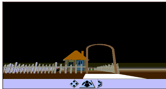
Figure 1: A picture from the virtual world – the house in the forest that the user must reach.

The appearing and disappearing objects and voices reflect the developmental element of object constancy, according to Piaget. Up until the age of 8 months, infants think that if a certain object disappears from sight then it no longer exists. Only when the infant is about one year old does s/he start to look for hidden objects, but even then s/he will look in the first place that the object was hidden. Only as the toddler reaches the age of two years old does s/he learn that objects that s/he cannot see still continue to exist (Flavel, 1970). As a result, the toddler feels a sense of instability, living as he does in a world in which objects and people appear and disappear, and it is not clear what is going on around him. He lives with a feeling that he lacks control over his environment (Freiberg, 1974). Searching for the house via the paths represents the way the infant experiences things and learns – by trial and error (Flavel, 1970).